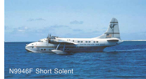
N9946F Short Solent