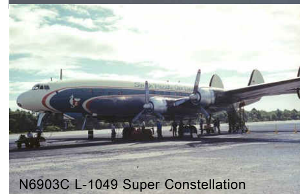
N6903C L-1049 Super Constellation