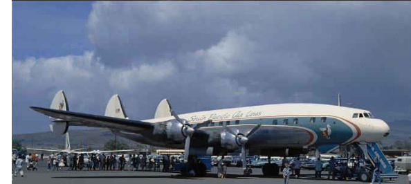
N6903C L-1049 Super Constellation