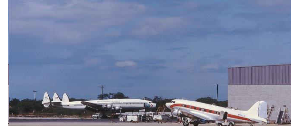
N6904C L-1049 Super Constellation